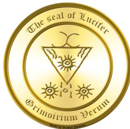
This is the seal of Lucifer from Grimorium Verum.

Do not touch the boundaries of the circle with your index finger. Summon the Element of Air.