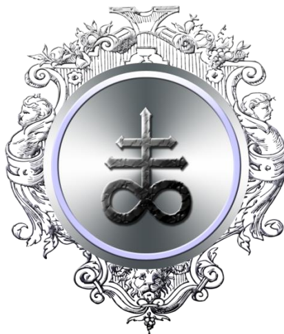
This is the seal of Leviathan.

Pull apart two heavy dark blue curtains. Open an imaginary door with an imaginary rusty key and see the seal of Leviathan floating over the world ocean, because Leviathan is the Lord of Waters.