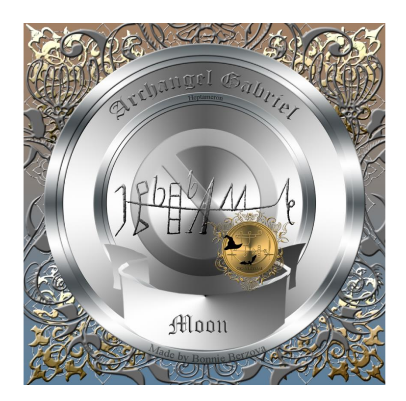
This is the seal of the planetary Archangel

Pull apart two heavy dark blue curtains. Open an imaginary door with an imaginary rusty key and see the seal of Gabriel floating in the air.