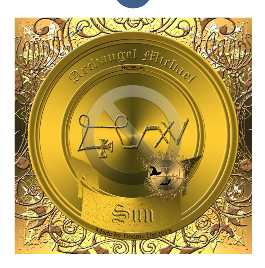
This is the seal of the planetary Archangel of Sun,