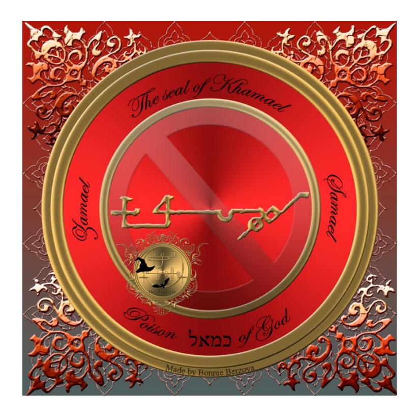
This is the seal of Khamael (actually Samael)

Move clockwise towards the northern point of your circle. Point with your Athame or the wand to the North and visualize the seal of archangel Khamael hanging in the air right in front of you.