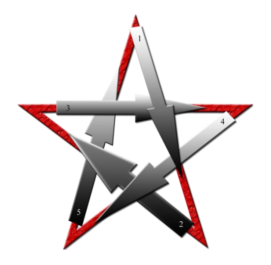
This is the banishing pentagram. Start at the top and finish at the top.

Say: "Thank you, archangel Khamael. My rite is over now and I give you the license to depart. Go now in peace. I see you again soon."