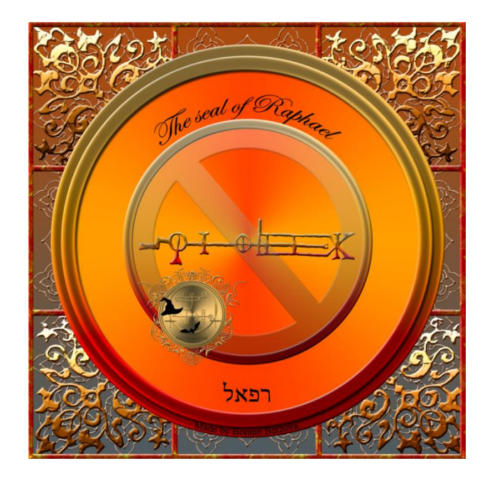
This is the seal of the planetary Archangel of Mercury,

Point your ritual knife or the wand towards the East. Do not touch the boundaries of the circle. Summon the Element of Air.