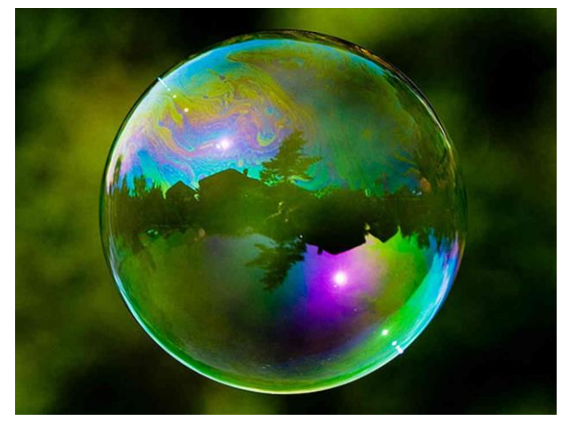
Imagine yourself standing inside this bubble.

The creation of a circle boundary. During this step you surround yourself and your Temple space with an imaginary flaming sphere (a large globe). You should never cross the circle boundary, except in cases of emergency.